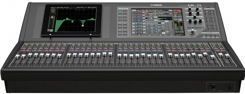
Mfr Part No. QL5 Rentex Product No. MXR6400

The acclaimed CL series raised live digital mixing console performance to an unprecedented level of refinement with evolved sound quality, operability, and functionality, while maintaining the traditional values that have made Yamaha digital mixers industry standards. Core features and performance inherited directly from the CL series, including natural sound supported by sonically superb internal processing capabilities, operation that easily adapts to the demands of just about any working environment, and built-in Dante networking that facilitates flexible system configuration, have now been condensed and concentrated into the compact QL series digital mixing consoles.