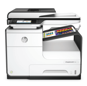
HP PageWide Pro 477dw Multifunction Printer