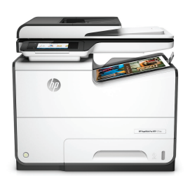
HP PageWide Pro 577dw Multifunction Printer