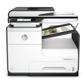
HP PageWide Pro 477dn Multifunction Printer

Ultimate value and speed—HP PageWide Pro is faster<sup>1</sup> and more affordable<sup>2</sup> than any other color MFP in its class. Get professional-quality color documents, fast two-sided scanning, plus best-in-class security features<sup>3</sup> and energy efficiency.<sup>4</sup>