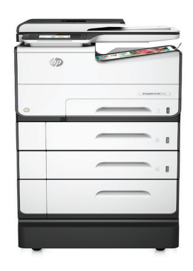
HP PageWide Pro 577z Multifunction Printer